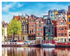
Amsterdam & Rotterdam