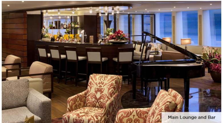
Main Lounge and Bar